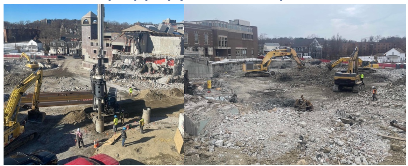
NOTE: Demolition is expected to resume on Monday, February 3.